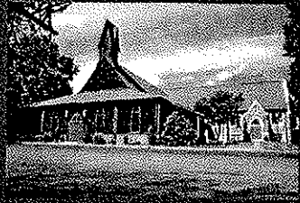
The Church of the Ascension 3717 Philadelphia Pike Claymont, DE 19703 (302) 798-6683

We are well along in the transition process, but there remains much to be done. Right now, our primary task as members is to participate in the September start-ups of ministry, activity and worship. Your leadership and I will be able to keep you posted on developments that bring the transition process to fruition ... to a new rector! For now, let's all rededicate ourselves to weekly worship, to active ministry, and to frequent participation in what Ascension has to offer us, which, thanks be to God, is just so much!