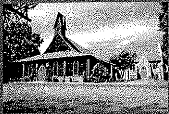
The Church of the Ascension 3717 Philadelphia Pike Claymont, DE 19703 (302) 798-6683